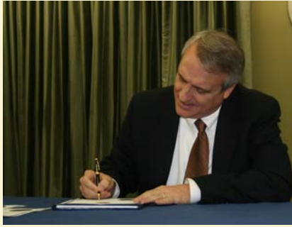
Colorado Local Government

The constitution divides the power of government into three parts or branches: The Legislative Branch which makes the law, the Executive Branch which enforces the laws, and the Judicial Branch which interprets the laws. The Colorado legislature (General Assembly) is made up of two groups the Senate and House of Representatives. The people in these groups are known as 'citizen legislators' because they hold a variety of jobs, ranging from ranching to teaching, during the times they are not serving in the General Assembly.